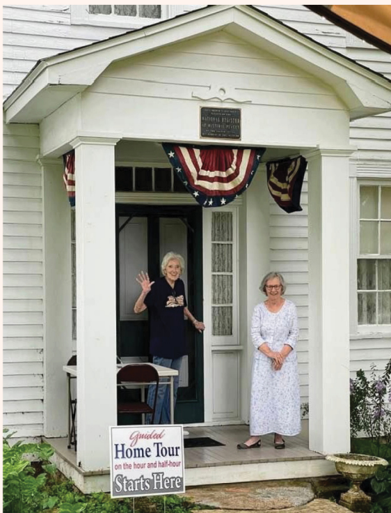
The historic Thomas Elwood Lindley House, located just off the Hwy. 150 West on Willow Creek Rd. in Paoli is available for tours in season by appointment only.

Make plans to stop in and see us at our Annual Holiday Open House at the Museum on November 19th from 1 to 4 p.m. The event is being held in conjunction with the Paoli Merchants Open House. Tour the Museum and pick up a little something up from our Museum Shop. We also have Gift Memberships! Admission will be FREE; however, donations will be accepted to help maintain the museum and our historic collection.